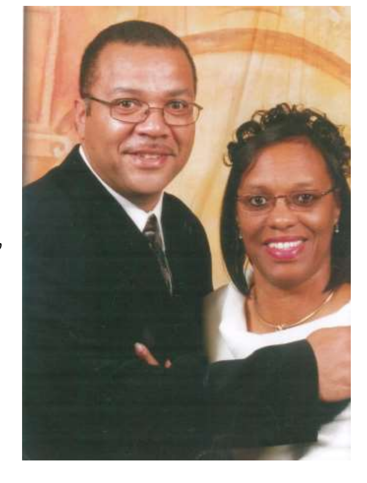
Psalm 121:1-2 A song of ascents. I lift up my eyes to the mountains- where does my help come from? My help comes from the LORD, the Maker of heaven and earth.

"Thank you for dancing with us in the rain"